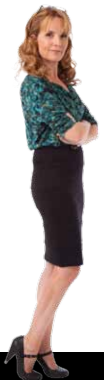
Prof. Abbie Lambert (Lea Thompson, Back to the Future)